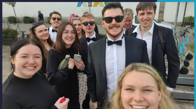
Galway City Chamber Choir on a European Tour, 2022

Our culture revolves around the development of both new and experienced musicians from and or based in Galway. We find many Irish organisations tend to focus on importing excellent music and musicians from outside of Ireland and showcasing it as Irish art. We firmly believe supporting and educating our resident artists and population is the best way to develop a thriving music community for years to come.